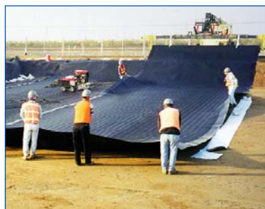
Workers position a piece of thick, plastic liner over the compacted soil base. This piece of plastic liner will be welded to the adjacent pieces of plastic liner.