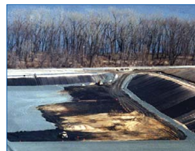
Construction of this ash landfill cell is complete and the landfill has begun to receive ash.