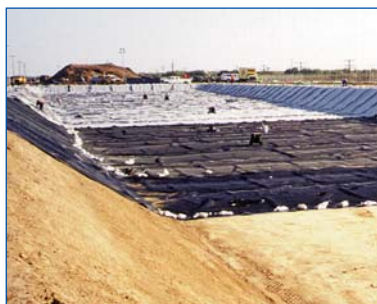
This ash landfill "cell" under construction shows compacted soil base, a thick, plastic liner, and a drainage layer. The berm is designed to contain water to be collected for safe disposal.